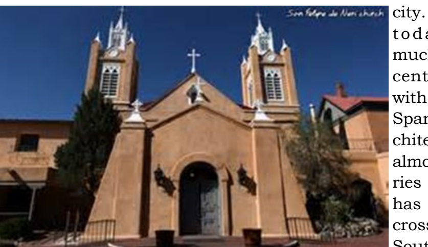
San Felipe de Neri Church—1793

The San Felipe de Neri Church is the oldest building in the