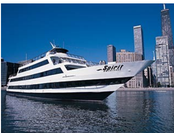
Spirit of Chicago