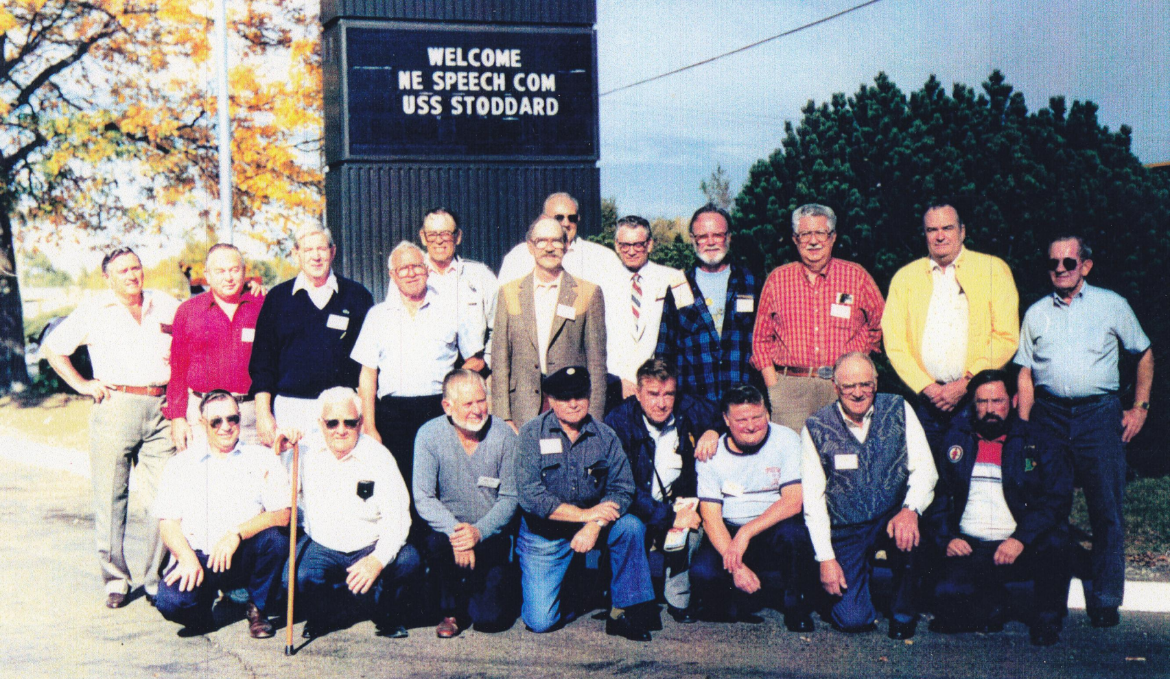
1st Reunion - North Platte, NE 1986